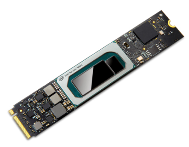
Intel® Nervana™ NNP-I is available in multiple configurations as shown in the table below.